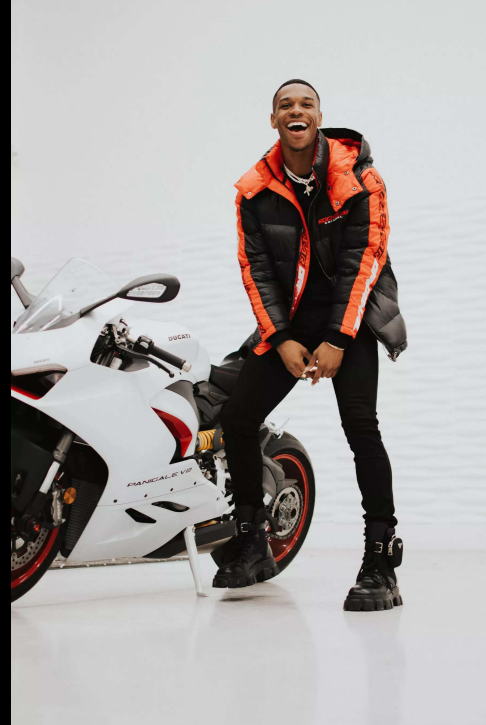
shein called ↗